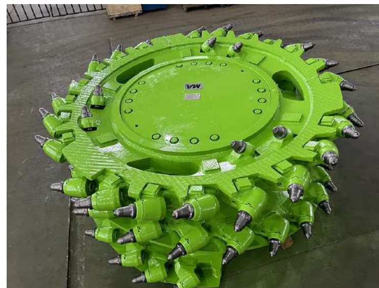
Shearer Drum Diameter (mm)